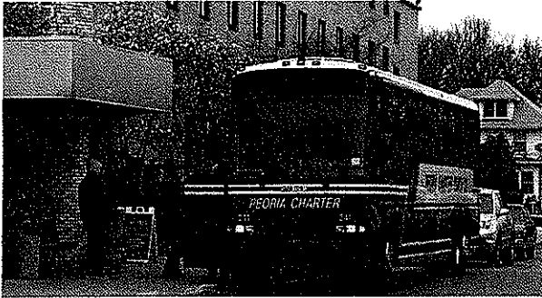
Note: Bus does not have its IDOT Destination Requirement & Bradley students boarding after a kick off in Student Center. Vehicles of Smith's campaign follow.

Pictures below taken on March 28, show transportation and escort service being provided.