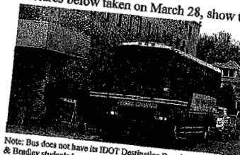
Note: Bus does not have its DOT Destination Requirement & Bradley students boarding after a kick off in Student Center. Vehicles of Smith's campaign follow.

Pictures below taken on March 28, show transportation and escort service being provided.