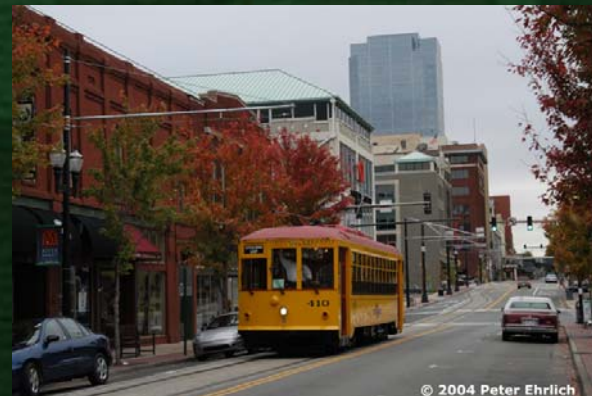
Little Rock, AR