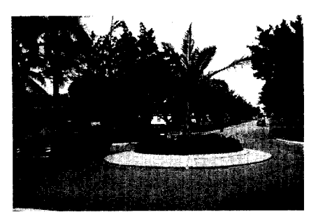
Figure 6. Mini-Traffic Circle (Naples)

longer emergency response times and you, the engineer or planner, can only offer a nicer street environment. It is easier when you are arguing one safety impact versus another.