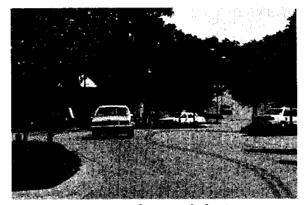
Figure 2. Chicane (Alachua)