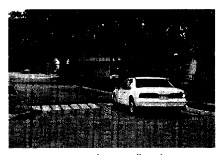
Figure 8. Raised Crosswalk (Palmetto)

the most vocal critics of traffic calming. Three tactics have been used to assuage fire department concerns. One is to keep traffic calming measures off emergency response routes. In one locality, enough controversy has arisen to prompt a moratorium on new traffic calming along streets that may, eventually, be classified as emergency response routes. Two departments—traffic and fire—are working together to set limits on the number and type of traffic calming measures allowed on such routes. Another tactic is to conduct formal response time studies, as in Boulder, Portland and Sarasota. Delays are usually measured in seconds rather than minutes. The third tactic is to design traffic calming measures around the needs of fire depart-