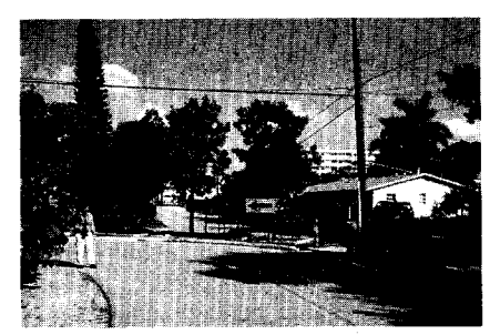
Figure 4. Full Diverter (Ft. Lauderdale)

Bellevue, Washington, USA, Berkeley, California, USA, Gainesville, Florida, USA, Gwinnett County, Georgia, USA, Howard County, Maryland, USA, Lee County and Tallahassee, Florida, USA. In our final report, we will make an attempt to summarize the mass of data from such studies.