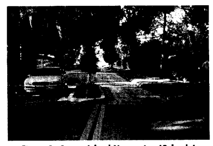
Figure 1. Center Island Narrowing (Orlando)

studies of traffic speed, volume and accidents; concerns of police, fire, public works and citizens, and how their concerns have been addressed; liability, lawsuits and damage claims associated with traffic calming measures; geometric design and spacing of measures; proce-