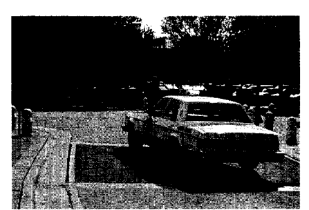
Figure 9. Raised Junction (West Palm Beach)

ments. Many jurisdictions design traffic circles with mountable outer curbs or aprons, and some use removable bollards on street closures or diverters. Several are shifting to longer humps, speed tables or offset humps to accommodate fire equipment.