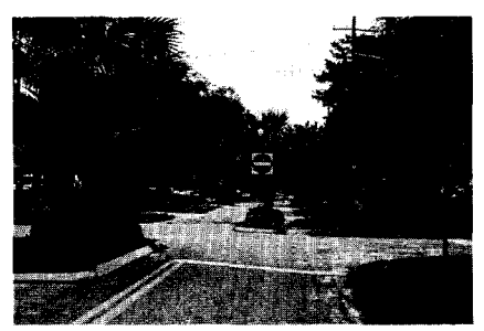
Figure 10. Semi-Diverter (Gainesville)

vailed over stiff opposition from fire departments.