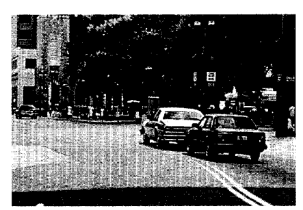
Figure 7. Nub (Jacksonville)

them. From the standpoint of emergency services, street closures and speed humps seem to be the most problematic measures.