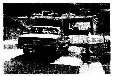
Figure 11. Speed Table (Tallahassee)

rational process documents the existence and nature of traffic problems via speed and volume measurements; proposes traffic calming measures that are capable of solving documented problems; installs measures on a temporary basis subject to performance evaluations; and finally, takes speed and volume measurements to see if measures have performed as expected before making them "permanent."