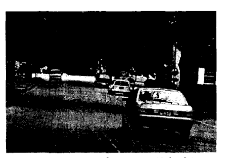
Figure 12. Textured Pavement (Orlando)

(e) In two or three jurisdictions, opponents of traffic calming have challenged the legality of measures on the ground that they do not appear in the Manual of Uniform Traffic Control Devices nor in other national manuals. Berkeley, whose traffic calming program dates back the furthest (to a 1974 traffic management plan), was sued in the early years for installing diverters. The matter was settled when the California legislature declared them legal traffic control devices. Over time, as installations have become commonplace, arguments over the legality of traffic calming measures have become academic.