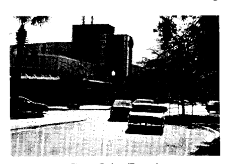
Figure 5. Jog (Tampa)