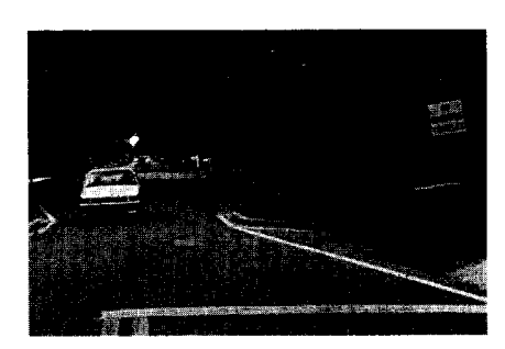
Figure 3. Choker (Sarasota)

(a) Studies of traffic calming impacts on speeds and volumes were furnished by Boulder, Colorado, USA, Ft. Lauderdale, Florida, USA, Naples, Florida, USA, Orlando, Florida, USA, Phoenix, Arizona, USA, Portland, Oregon, USA, Sarasota, Florida, USA, Seattle, Washington, USA and Tampa, Florida, USA. Additional studies have been promised by Arlington County, Virginia, USA,